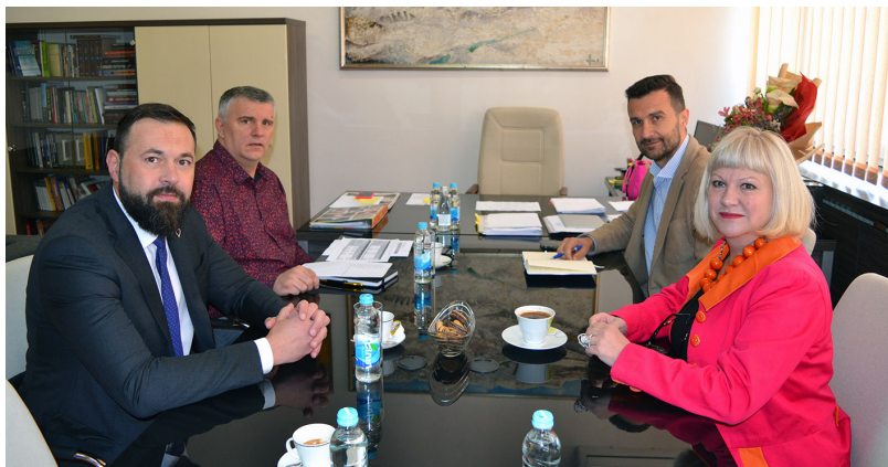
Minister Sanja Vlasisavljević met with the Minister of Culture and Sports of the Sarajevo Canton, Kenan Magoda

This was an opportunity to exchange experiences in the field of culture and sports at the federal and cantonal level, but also to agree on concrete joint steps in the coming period.