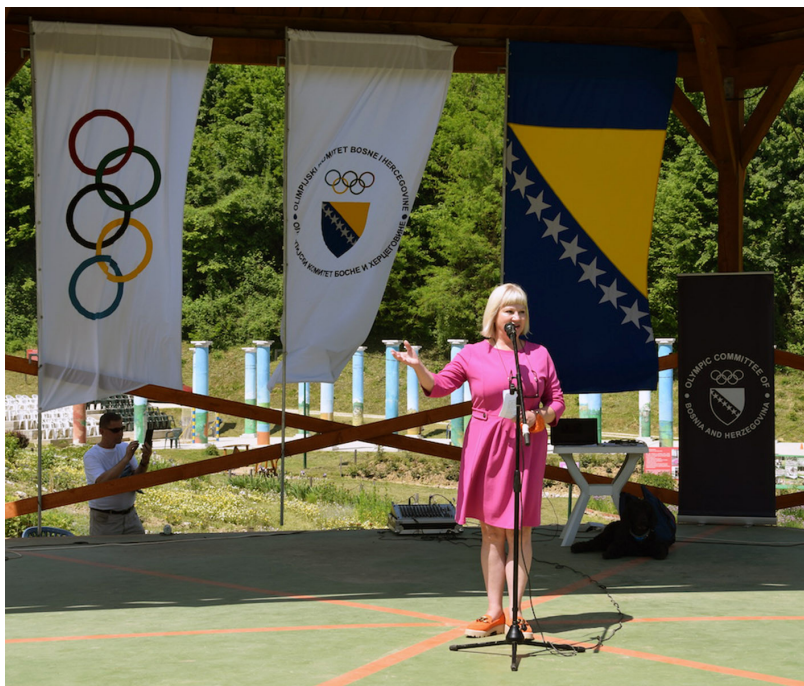
Minister Vlasisavljević at the Opening of the “Olympic Day 2023” in Visoko

This was an opportunity to exchange experiences in the field of culture and sports at the federal and cantonal level, but also to agree on concrete joint steps in the coming period.