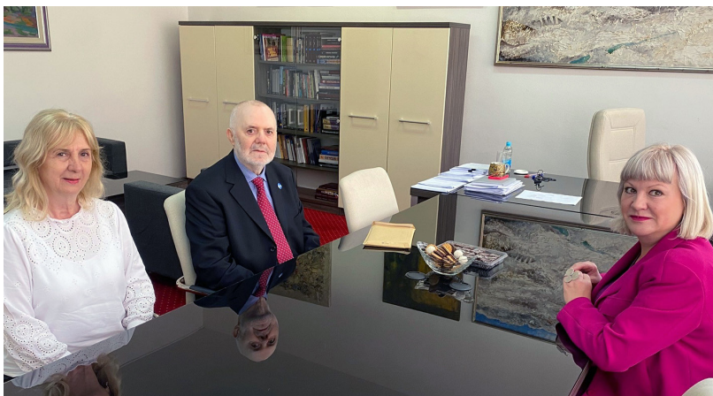
Minister Vlasisavljević met with representatives of the Matica hrvatska Mostar

This year's Fair was organized as a part of the international programme of celebrating the 20th anniversary of the UNESCO Convention on Intangible Cultural Heritage. Minister Vlasisavljević welcomed the participants who gathered from eighteen different places and stressed in her address the importance of safeguarding the intangible cultural heritage.