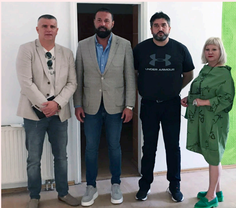
Minister Sanja Vlasisavljević visited the Paralympic Committee of BiH

Considering all the successes achieved by the Paralympic athletes, it is necessary to help the Committee to be able to work with dignity and create a better environment for the athletes.