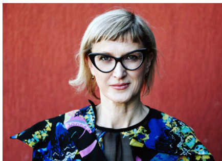
Congratulations to the team: The series "I know How you Breathe" by Jasmila Žbanić and Damir Ibrahimović included in the main programme of the 80th Venice Film Festival