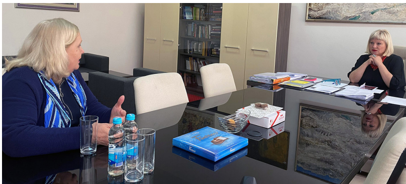
Minister Sanja Vlasisavljević met with the Acting Director of the National Film Archive of Bosnia and Herzegovina Devleta Filipović

“Federal Ministry of Culture and Sports would always be a partner to the National Film Archive of Bosnia and Herzegovina, as well as to all other cultural institutions – a partner for cooperation and more concrete problem-solving, in accordance with its possibilities and competences“, was the message of Minister Vlasisavljević.