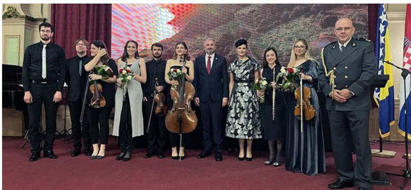
Minister Vlasisavljević at the reception on the occasion of the National Day of the Republic of Croatia

“Federal Ministry of Culture and Sports would always be a partner to the National Film Archive of Bosnia and Herzegovina, as well as to all other cultural institutions – a partner for cooperation and more concrete problem-solving, in accordance with its possibilities and competences“, was the message of Minister Vlasisavljević.