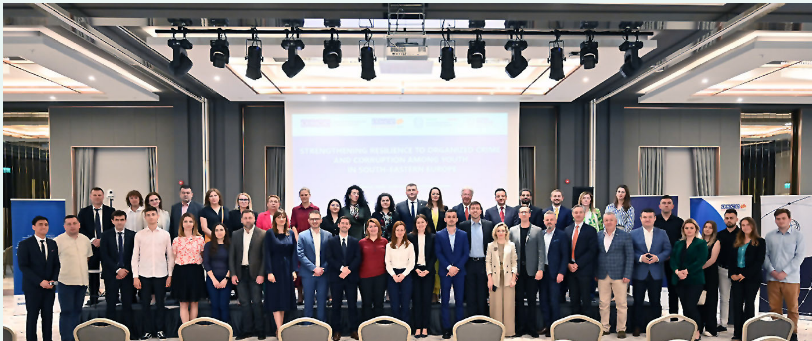
Skopje, North Macedonia: Assistant Minister, Adis Salkić, at the conference “Strengthening resistance to organized crime and corruption among young people in South-Eastern Europe”

We marked 12 August - International Youth Day