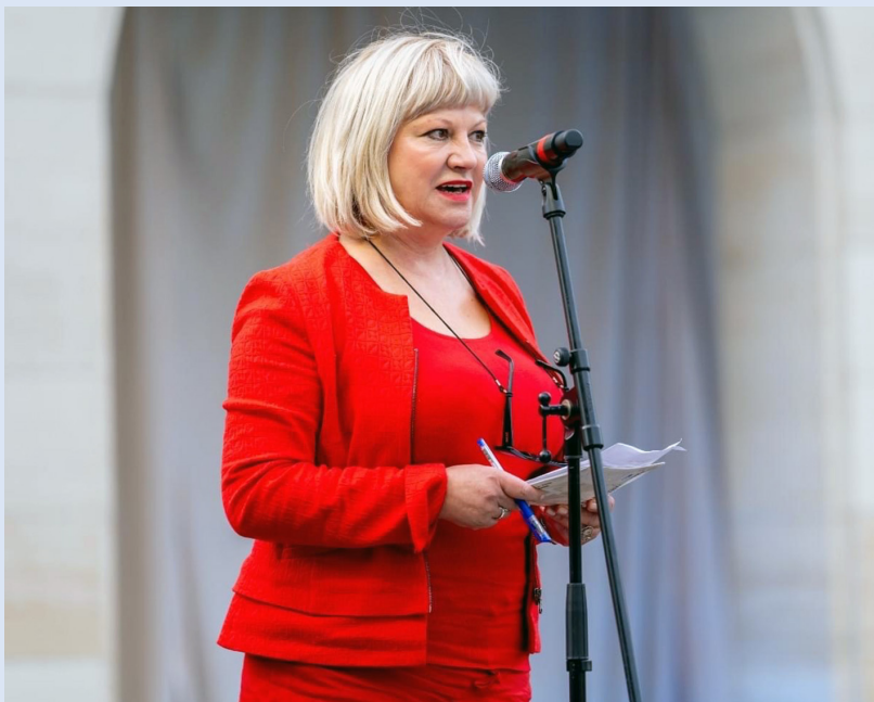
Mostar: Minister Sanja Vlasisavljević opened the National Fair of Original Folklore of Croats in Bosnia and Herzegovina

This year's Fair was organized as a part of the international programme of celebrating the 20th anniversary of the UNESCO Convention on Intangible Cultural Heritage. Minister Vlasisavljević welcomed the participants who gathered from eighteen different places and stressed in her address the importance of safeguarding the intangible cultural heritage.