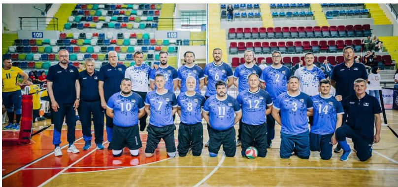
Congratulations: BiH national team in sitting volleyball defended the title of champion of the Golden League of Nations